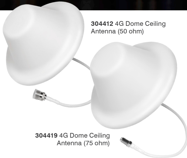
304412 4G Dome Ceiling Antenna (50 ohm)