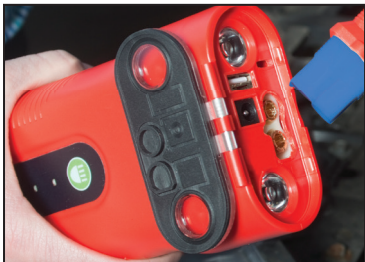
Once it Starts, Disconnect Clamps from Weego 70