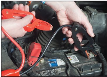
Attach Black (-), Then Red (+)