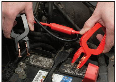
Detach Clamps From Battery