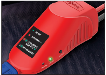
When You Have SOLID GREEN LIGHT On Your Smart Box, Start Your Engine