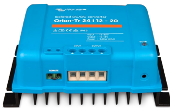
Orion-Tr 24/12-20 (240W)