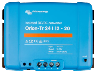
Orion-Tr 24/12-20 (240W)