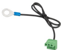
Connector with preassembled DC minus cable (included)

The BatteryProtect disconnects the battery from non-essential loads before it is completely discharged (which would damage the battery) or before it has insufficient power left to crank the engine.