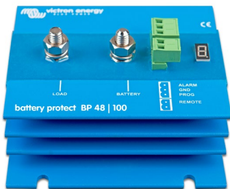
BatteryProtect BP 48-100

With 7-segment LED display: easy to set up