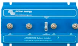
Argo Diode Isolator 140-3AC

Diode battery isolators allow simultaneous charging of two or more batteries from one alternator, without connecting the batteries together. Discharging the accessory battery for example will not result in also discharging the starter battery.