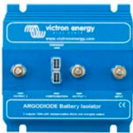
Argo Diode Isolator 120-2AC