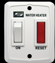
D, DE MODEL ON/OFF SWITCH

White: #232882 Black: #233111 Cream: #232881