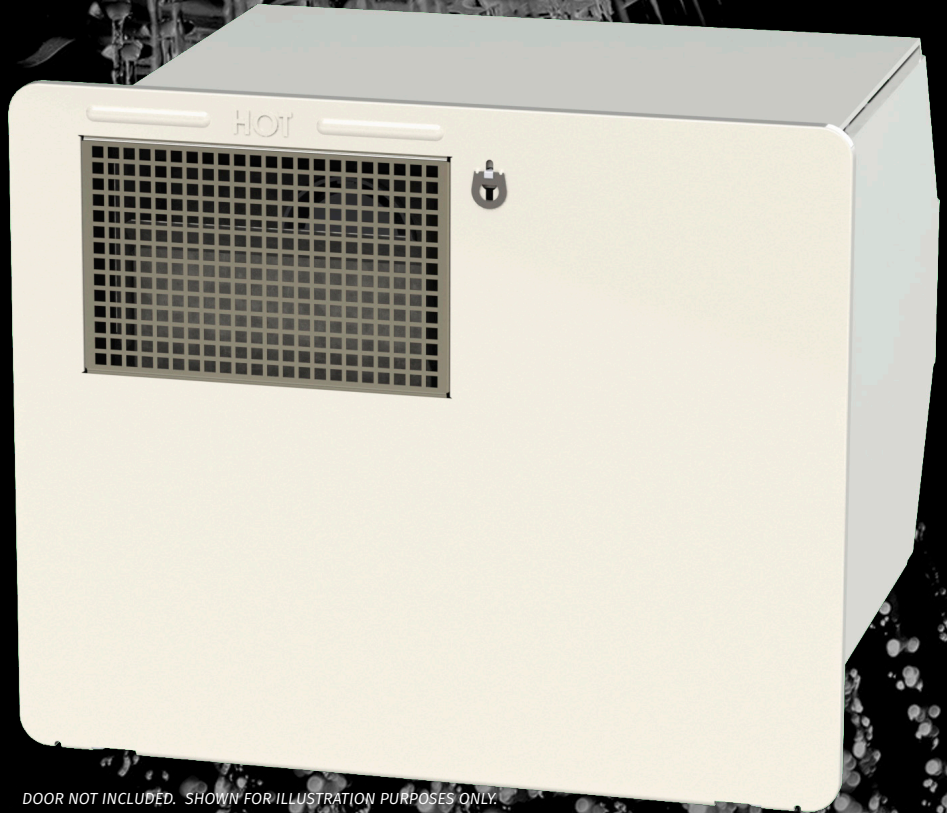
DOOR NOT INCLUDED. SHOWN FOR ILLUSTRATION PURPOSES ONLY.

Slows combustion process to transfer more heat to water in tank.