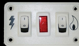
Domatic/Atwood Style Direct Spark Ignition with Electric Element Indoor Mounted Switch.

White: #234589 Black: #234229 Cream: #234795