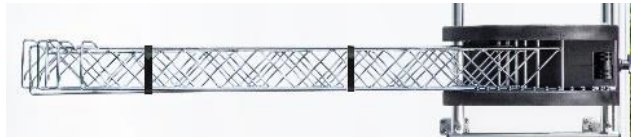
Properly Installed Housing