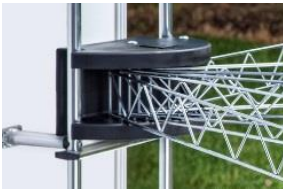
Storage Position Clamshell