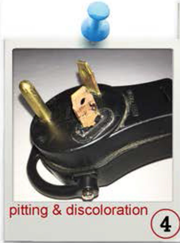
pitting & discoloration