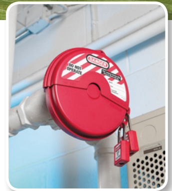
ELECTRICAL & VALVE SAFETY