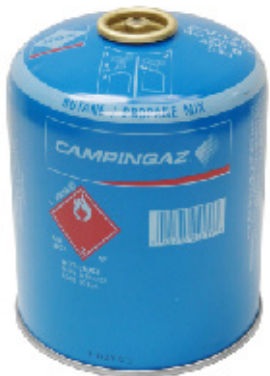
PROPANE/BUTANE Camping GAZ® CV-270 / CV-270 Plus CV-470 / CV-470 Plus