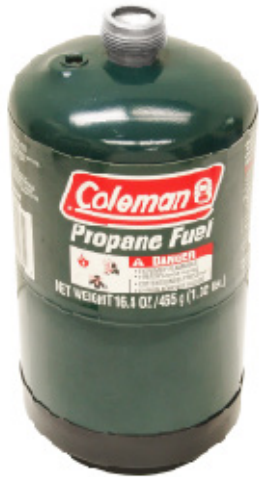
PROPANE DOT-39 NRC 228/286