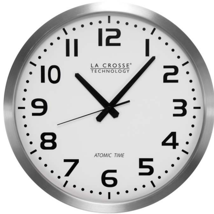
Model: WT-3161WH DC: 062617