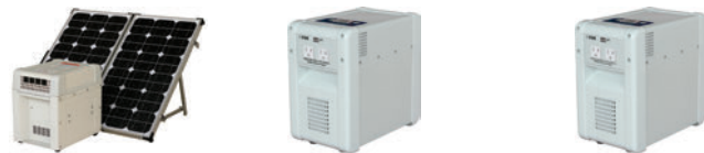
HS1800-60-00: 1800W Home Solar Kit