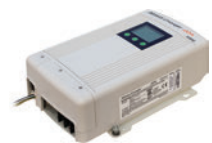
AC1220: 20A/12V Smart Charger