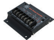
SC1220LD: 20A Charge Controller