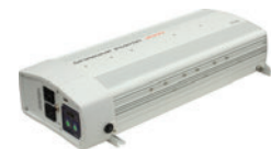
SWXFR1230: 3000W Sinewave Inverter with Transfer Switch