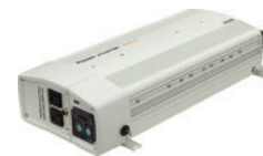
MW1230HW: 3000W Inverter