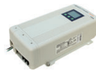
AC1260: 60A/12V Smart Charger