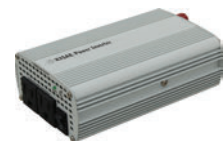
MW1204: 400W Inverter