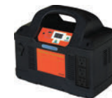
PP800: 800W Powerpack