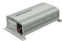
MW1210: 1000W Inverter