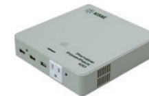
PP100: 100W Lithium Powerpack