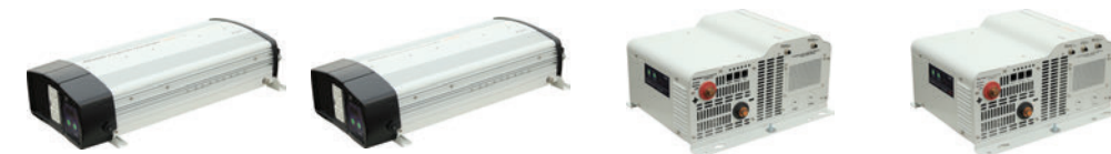
IC121040: 1000W Sinewave Inverter with 40A Charger