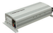
MW1215: 1500W Inverter