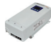
AC2430: 30A/24V Smart Charger