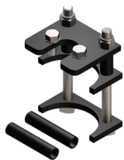
AP43090 Clamp Mounting Kit