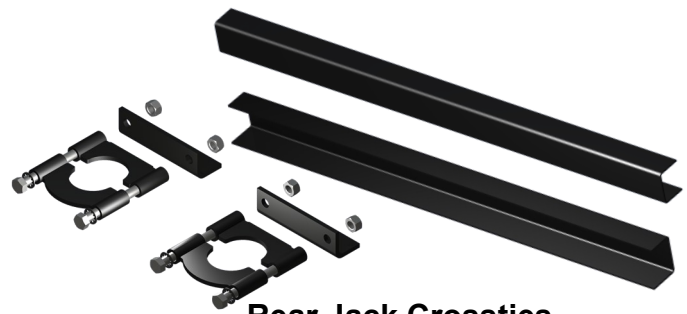
Rear Jack Cross-ties P51894 Crosstie Inner P43078 Crosstie Outer & AP49765 Clamp Kit Cross Tie