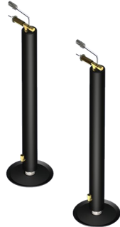
AP42894 Front Jack Kit Two Straight-Acting, (Power-Extend/Power-Retract) Jacks with a lifting capacity of 7,000 lbs. per jack and a 21" stroke

Some fabrication may be required for mounting.