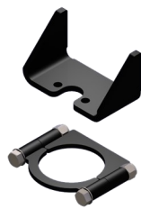
AP43594 Weld Mounting Kit