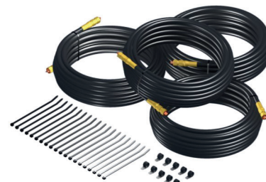
AP43072 & AP43085