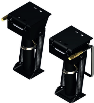
AP0228 Jack Kit

Workhorse/Chevy to 2001 - (Brackets Ordered Separately)