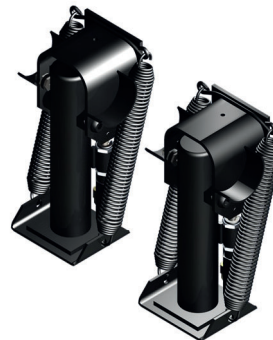
AP0229 Jack Kit

Two Kick-Down (Power-Extend/Spring-Retract) Jacks with a lifting capacity of 6,000 lbs. per jack Standard Profile