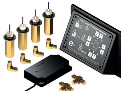
AP47562 Control Kit

725 Series, 12 Volt DC Motor and Pump 125 amp - 3,000 psi relief with prewired control module and jack valving