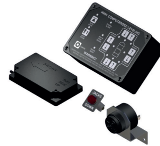
AP52399 Control Kit

725 Series, 12 Volt DC Motor and Pump 125 amp - 3,000 psi relief with prewired control module and jack valving