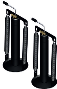
AP52397 Jack Kit

Ford F53/2004 and newer 19.5" & 22.5" Tires, 15,700 lbs., 18,000 lbs. or 20,500 lbs. GVWR 10 th Digit In VIN must be a four or larger