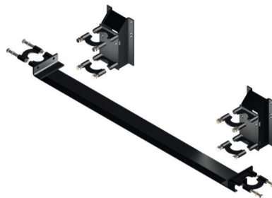
AP49762 Mounting Tie Kit