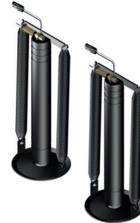
AP52398 Jack Kit

Two Straight-Acting (Power-Extend/Spring-Retract) Jacks with a lifting capacity of 6,000 lbs. per jack