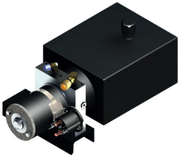
AP10471 Power Unit Kit

Two Kick-Down (Power-Extend/Spring-Retract) Jacks with a lifting capacity of 9,000 lbs. per jack Low Profile