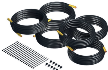
AP0240 Hose Kit

225 Series, Joystick-Controlled Hydraulic Leveling System with BI-AXIS ® Control and Integrated Indicator Light Panel & Leveleze ® Light Package