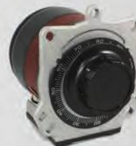
Transformer Brush 00771 (KS1272P-B) 00559 (KS1440PTCLP-B)