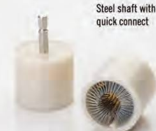
Steel shaft with quick connect