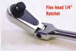
Flex-head 1/4" Ratchet