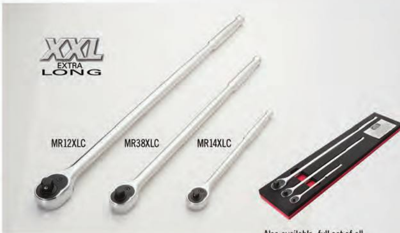
Also available: full set of all 3 ratchets Item # MR482XLC

PLEASE SEE FACING PAGE FOR COMPLETE SPECS.