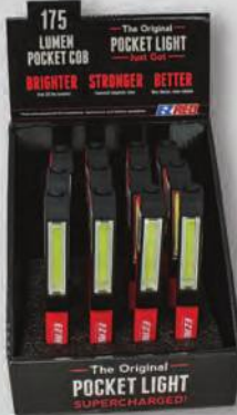
12 PCOB (RED)