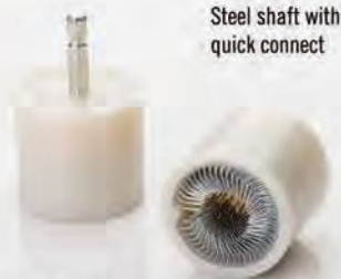
Steel shaft with quick connect