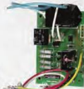
Polarity Board 00567 (1272-B Series) 00571 (KS1440PTCLP-B)