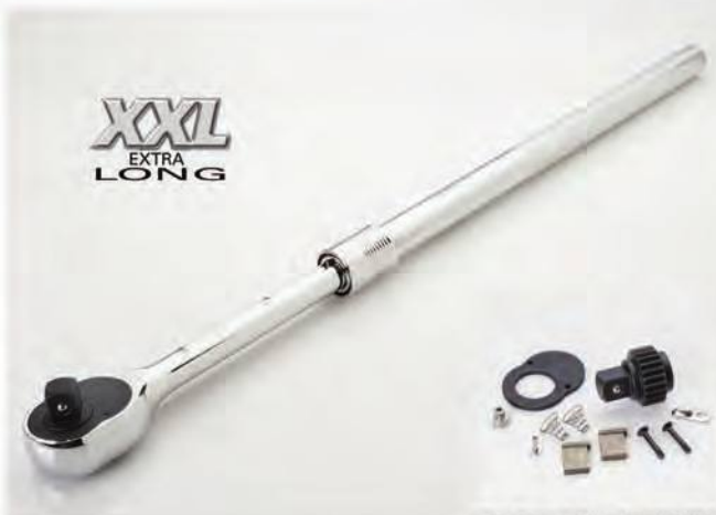
Head repair kit: Item # RK34 Head repair kit: Item # RK1X

PLEASE SEE FACING PAGE FOR COMPLETE SPECS.