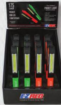
4 PCOB-OR, 4 PCOB-G