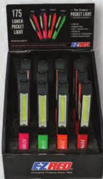
3 PCOB, 3 PCOB-OR, 3 PCOB-G, 3 PCOB-P