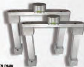
EZLDWA 2 – Drive wheel adapters designed to accommodate drive axle wheels that have automatic tire self-inflation systems.