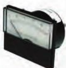
Amp Meter 00520 (All)