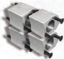
EZSSS 4 – Spacers designed to accommodate super single wheels.

Includes: 4 lasers, 2 fifth wheel pin adapters, 2 drive wheel adapters, two steer wheel bars, tape measure, and software package. Packaged in a blow-molded case.