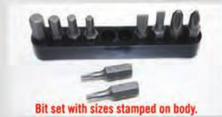
Bit set with sizes stamped on body.