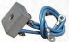
Rectifier 01306 (1272-B Series) 01304 (KS1440PTCLP-B)