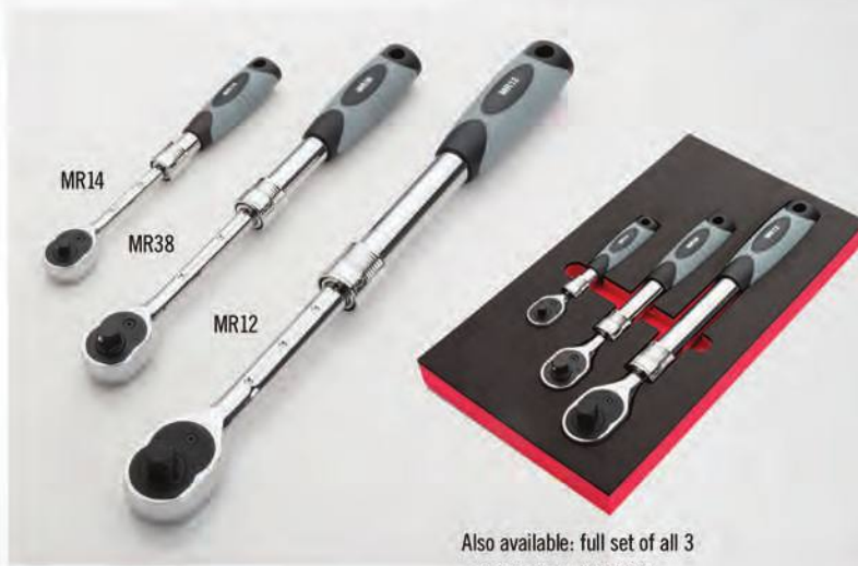
Also available: full set of all 3 ratchets Item # MR482