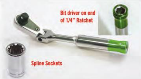
Bit driver on end of 1/4" Ratchet