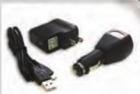
Wall Adapter, USB Cord, Mobile Charger Adapter