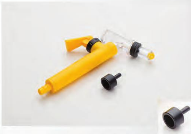
B901N Replacement Nozzle