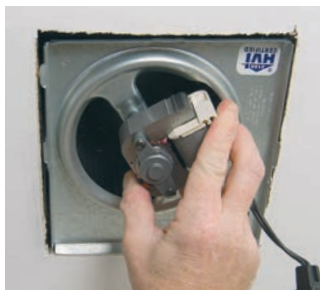
Snap in new motor to housing.