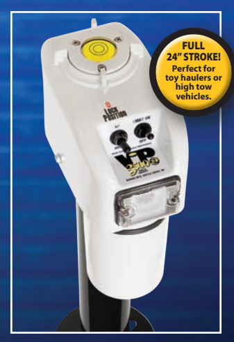
VIP 3500/24 - WHITE | P/N 31558