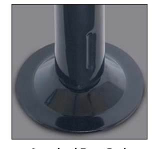
Attached Foot Pad.