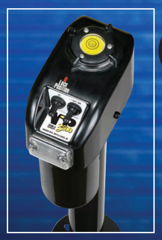
VIP 3500 - BLACK | P/N 32454