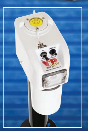
VIP 3000 - WHITE I P/N 30826