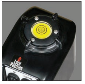
Patented built-in level right where you need it.