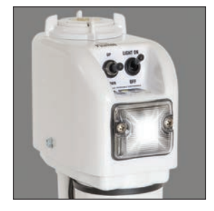
Nite-lite helps you hitch-up or unhitch.