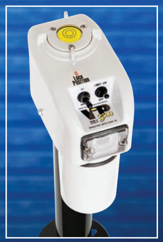
VIP 3500 - WHITE | P/N 30828