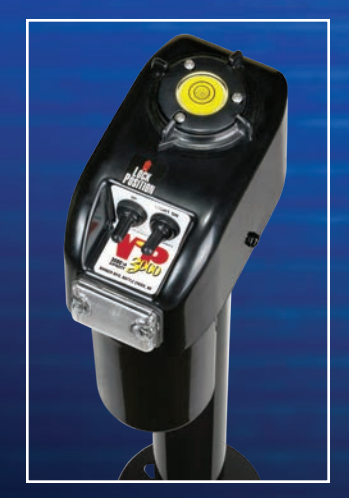
VIP 3000 - BLACK | P/N 32453