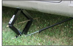
1 Box for Rear