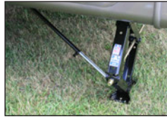
1 Box for Front