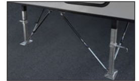
2 Boxes for Front