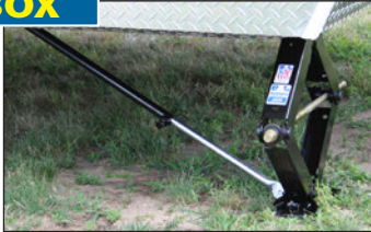
1 Box for Front OR Rear