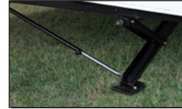
1 Box for Rear