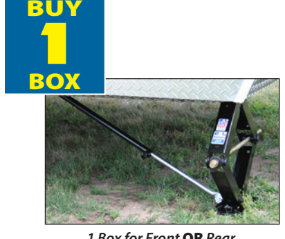
1 Box for Front OR Rear

• Assists in supporting jack leg to frame of trailer